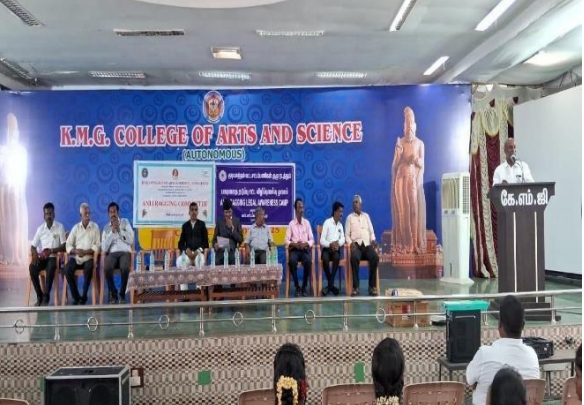
The senior lawyers from Gudiyattam interacted with students and gave their valuable advise